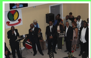
The first Board of Directors